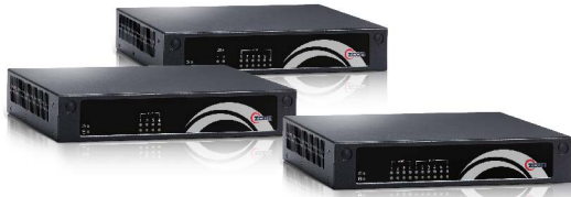
WS5G2 / WS7G2 / WS10G2